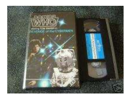
🖶 Larger Picture